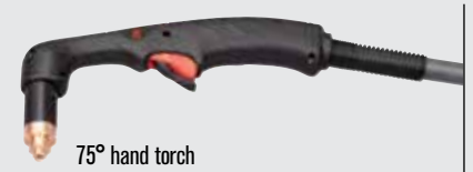
75° hand torch

(for more torch options, see www.hypertherm.com )