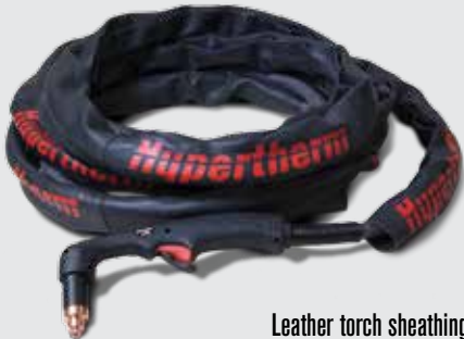
Leather torch sheathing