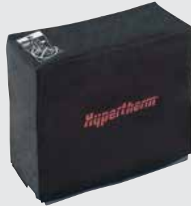
System dust cover