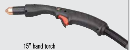
15° hand torch