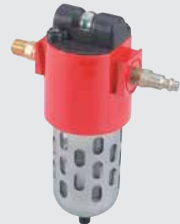
Air filtration kit